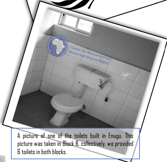
A picture of one of the toilets built in Enugu. This picture was taken in Block B, collectively, we provided 6 toilets in both blocks.

World Toilet Day (WTD) is an official United Nations international observance day to inspire action to tackle the global sanitation crisis . Worldwide, 4.2 billion people live without "safely managed sanitation" and around 673 million people practise open defecation according to UN Water. Also, three billion people lack basic hand washing facilities. This sanitation crisis means untreated human waste is spreading diseases into water supplies and the food chain for billions of people. According to the UN, Inadequate sanitation is estimated to cause 432,000 diarrhoeal deaths every year.